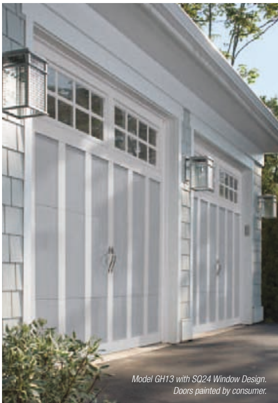
Model GH13 with SQ24 Window Design. Doors painted by consumer.